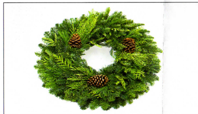
GREENS SALE: Awbury Arboretum, 1 Awbury Rd. in Germantown, 55 beautiful acres, will hold its annual greens sale and open house on Saturday, Dec. 8, 1-4 p.m. The afternoon will include free light refreshments, marshmallow roasting, cookie decorating, a visit from the Philly Goat Project's goats, etc. More details at www.awbury.org